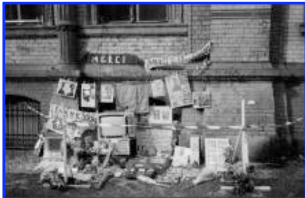
Hirschhorn. Otto Freundlich altar. Berlin Biennale, 1998.