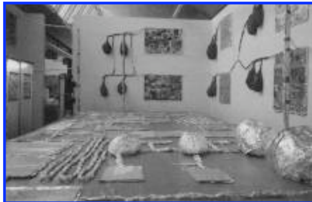
Thomas Hirschhorn. Tränetisch. Kunstmuseum, Luzern, 1996.