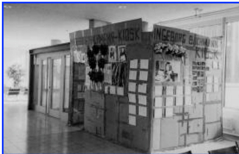
Hirschhorn. Ingeborg Bachmann kiosk. University of Zurich- Irchel, Zurich, 1999.