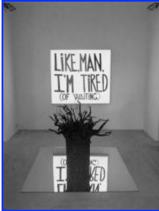
Durant. Like, Man, I'm Tired of Waiting . 2002. Courtesy the artist, Blum and Poe, and Galleria Emi Fontana.

“partially buried.” “I read it as a grave site,” Durant says of Partially Buried Woodshed , but it is a fertile one for him. 52