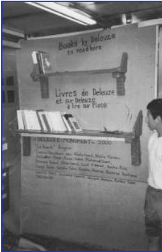
Hirschhorn. Deleuze Monument. 2000.

appeared in Amsterdam, but in the red-light district; the Deleuze monument in Avignon, but in a mostly North African quarter; and the Bataille monument in Kassel (during Documenta XI ), but in a largely Turkish neighborhood. These (dis)placements are fitting: the radical status of the guest philosopher is matched by the minor status of the host community, and the encounter suggests a temporary refunctioning of the monument from a univocal structure that obscures antagonisms (philosophical and political, social and economic) to a counter-hegemonic archive that might be used to articulate such differences. 18